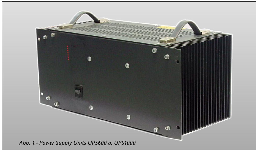
Abb. 1 - Power Supply Units UPS600 a. UPS1000

Several different versions of the power supply units are available, the UPS600, UPS1000, UPS1500, UPS10 and UPS25. While the UPS600 is used for mixers with up to 24 modules in total, the