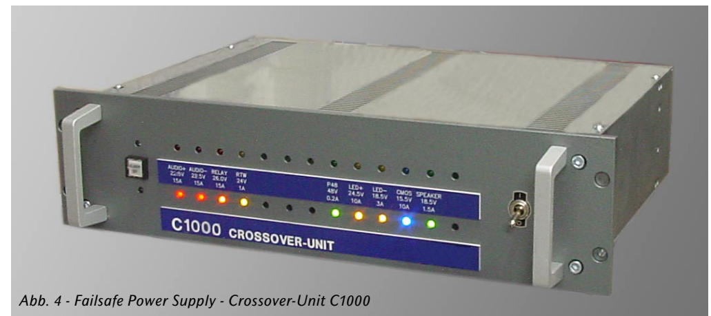
Abb. 4 - Failsafe Power Supply - Crossover-Unit C1000

The cross over unit is a 3U high rack mountable device. The total width of the front panel 483 mm. The actual width behind the top plate is 440 mm. Without attached connectors the C1000 and C1500 are approx. 320 mm deep. The only differences between the C1000 and C1500 version are the current of the diodes and the type of connectors that is used. While the C1000 uses diodes for a current load of 10 amps and a 20-pin connector,